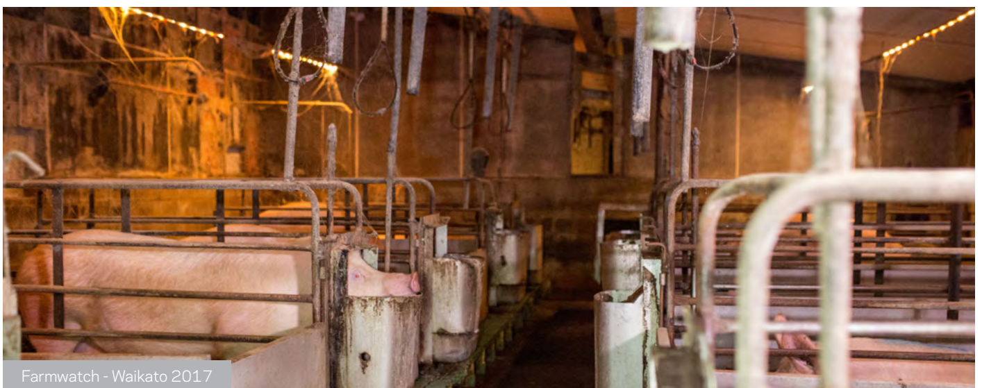
Farmwatch - Waikato 2017

With the implementation of the strategies previously discussed for minimising piglet mortality, non-crate systems can offer productivity equal or superior to that offered by farrowing crate systems. This was demonstrated by the economic modelling of Ahmadi et al. (2011), who demonstrated higher net margins in farrowing pens designed to incorporate such features.