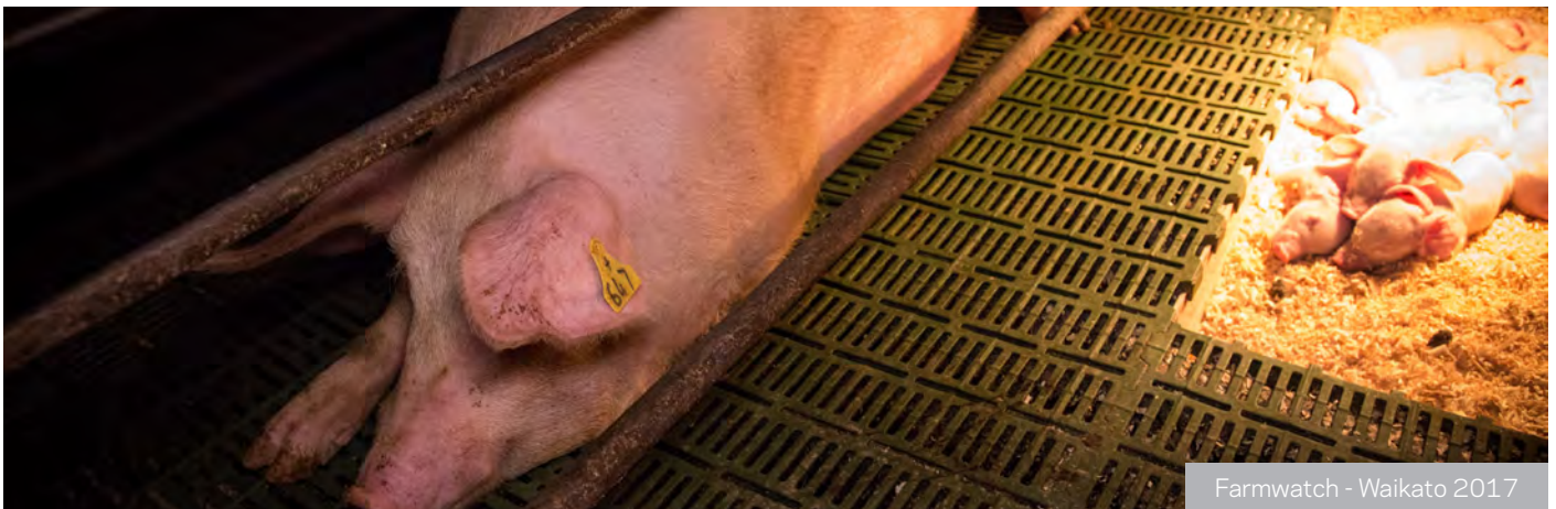
Farmwatch - Waikato 2017

Pig housing varies widely between farms in New Zealand, and sometimes even within the same farm. Sows may be housed outdoors, indoors, in stalls, in small pens with few companions, or in large bedded open sheds with tens of animals. As Stafford (2013) states, "... in reality sows may be in houses of almost any design imaginable." Housing systems may upgrade as farms increase in size and become better capitalised, may change from outdoor to indoor, and from stalls to small