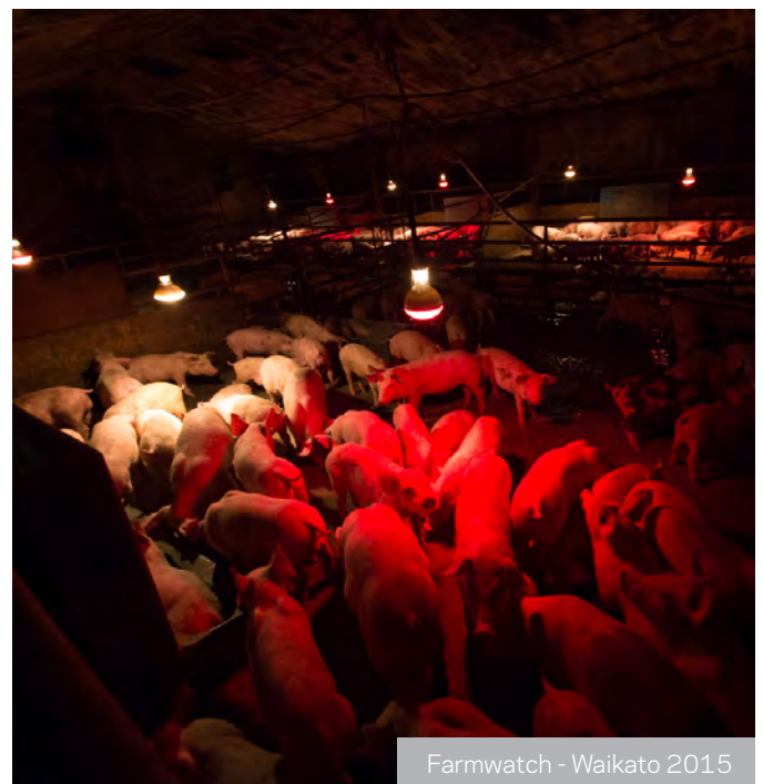
Farmwatch - Waikato 2015

In New Zealand, about 60% of all pork production units use farrowing crates (Welch, 2012). The remainder produce pork in extensive outdoor systems (Chidgey et al. , 2015).