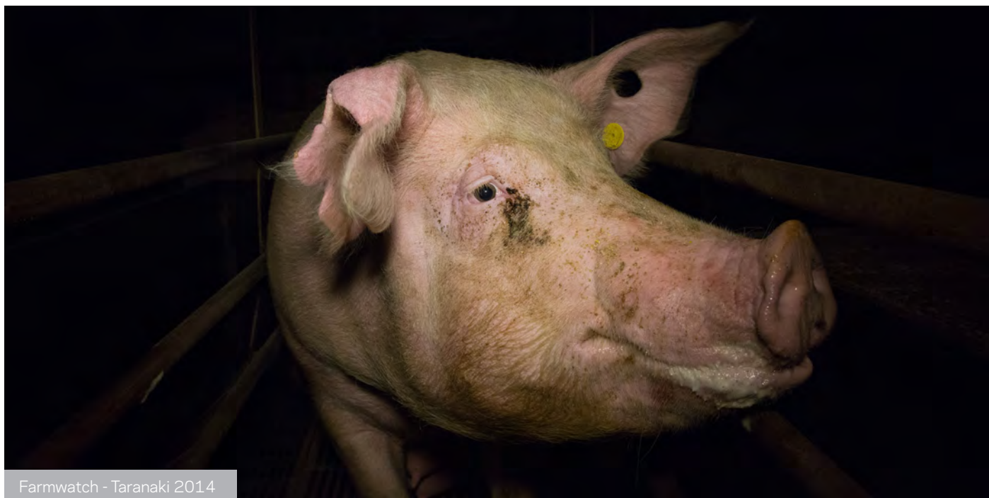
Farmwatch - Taranaki 2014

their aggressive interactions for at least three days, whereas aggression between animals housed in groups 'diminished rapidly'. Broom et al. (1995) also found that aggression of crated sows was more frequent, and escalated to a higher level, compared to group housed sows. It is likely that crates impede the expression of behaviours that would naturally resolve aggression, such as the retreat of subordinate animals (Dolf, 1986). This is likely to increase stress hormones (Barnett et al. , 1987). However, crates do prevent the infliction of physical injuries that can be caused by aggression.