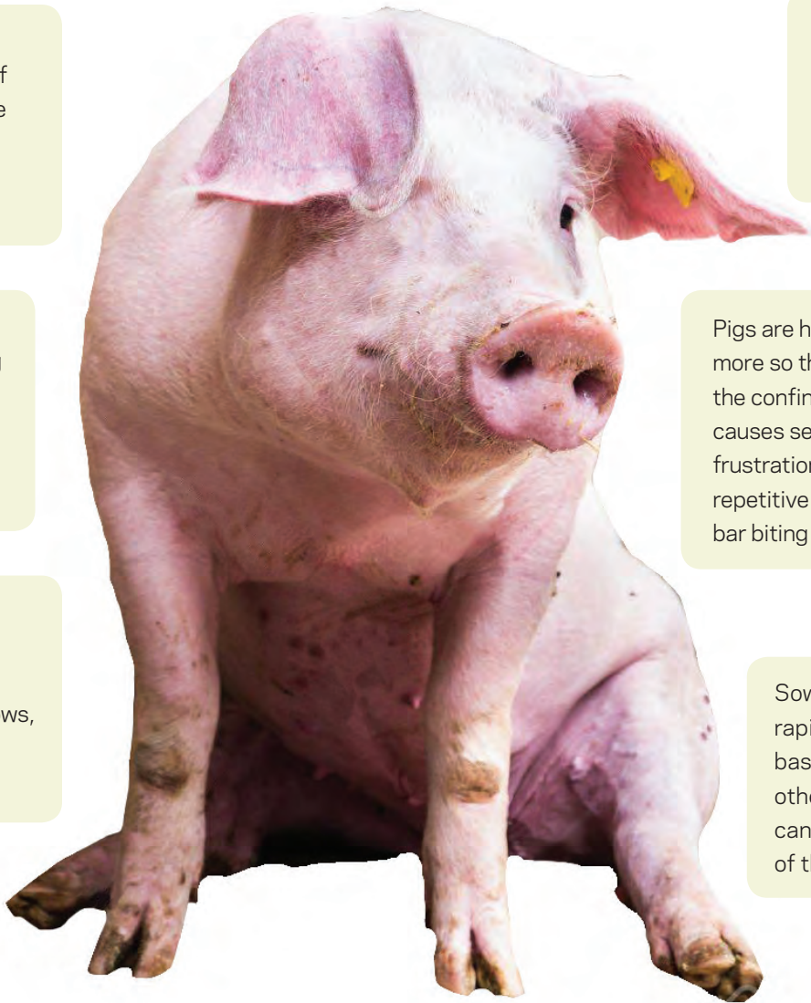
Figure 1: Welfare problems experienced by crated sows Sows are typically confined in farrowing crates for 4-6 weeks, 2-3 times each year.

Limb health and muscular strength is compromised, caused by exercise and movement deprivation.