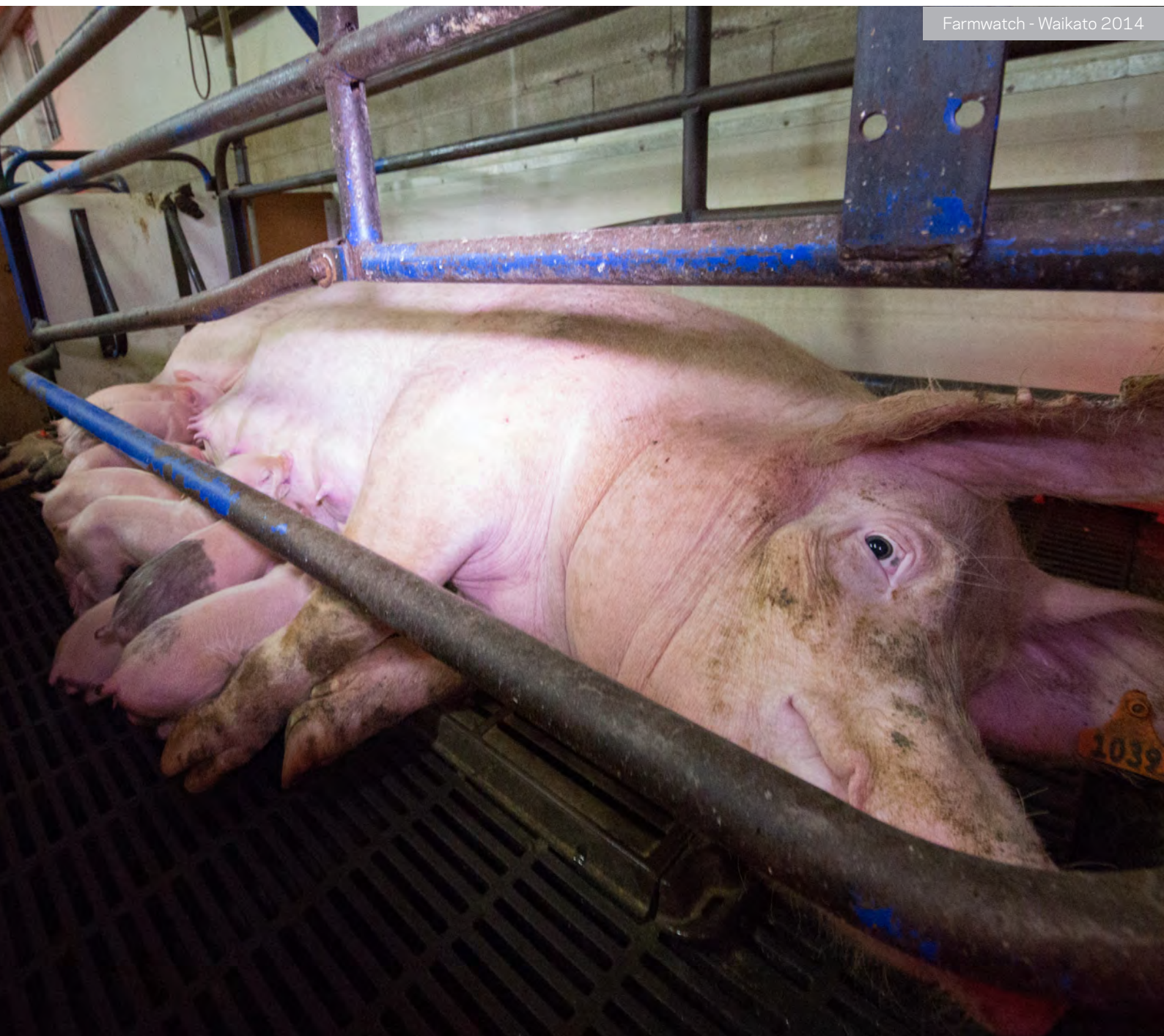
Farmwatch - Waikato 2014

owned about 90% of the national herd. 56% of these sows farrowed in a crate, 24% outdoors, 15% in a pen, and 5% in other systems. When considering the national herd in its entirety, Stafford (2013: 95) reported that over 40% of New Zealand pigs are managed outdoors – a high figure compared to most other nations. In contrast, Edwards (2005) reported that in the UK, approximately 30% of the national sow breeding herd is housed outdoors.