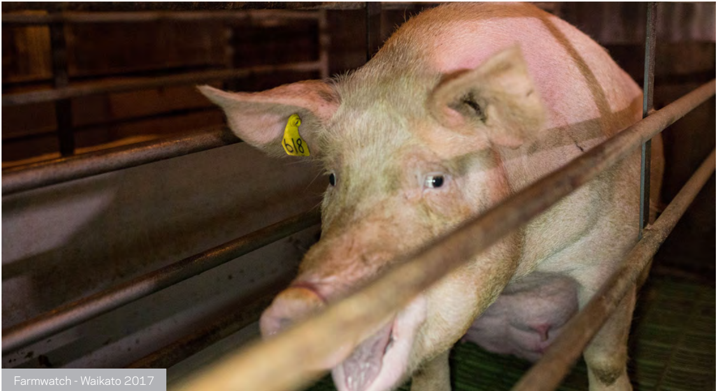
Farmwatch - Waikato 2017

Any consideration of the adequacy of various housing systems for farrowing sows and their piglets must start with a consideration of natural pig reproductive behaviour. Accordingly, key characteristics of pigs and their behaviours are reviewed in the following.